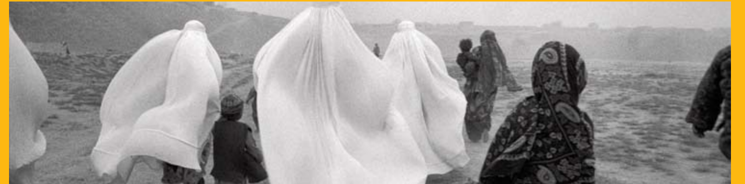
A sudden attack on a village A devastating earthquake